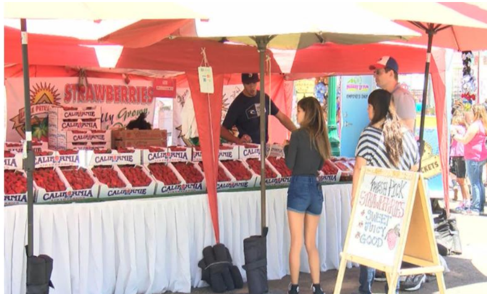
Santa Maria Strawberry Festival.

Agricultural fields in the Santa Maria Valley.