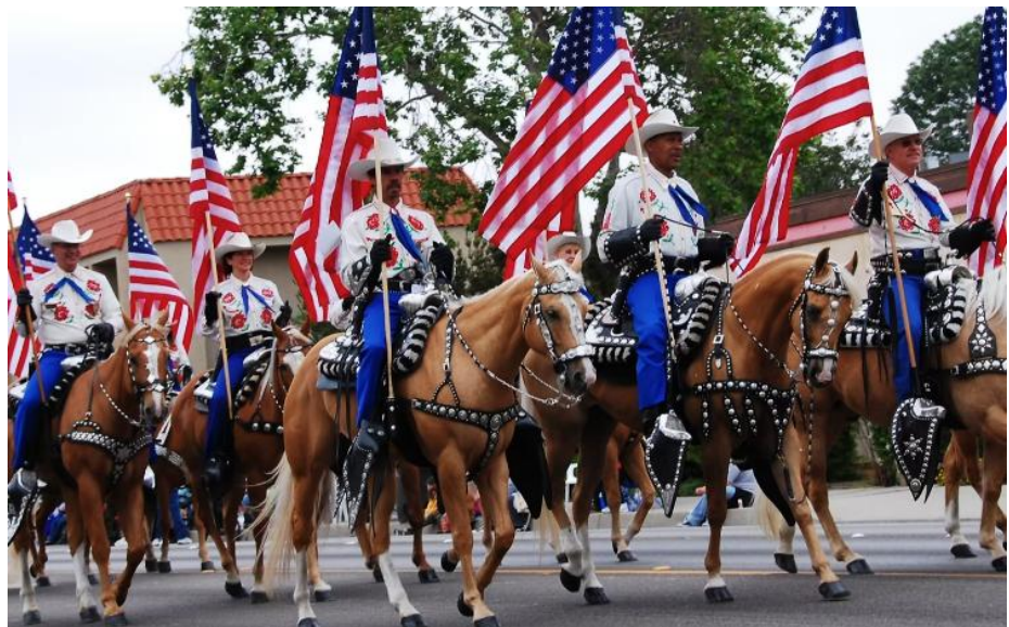
Santa Maria Elks Rodeo Parade.