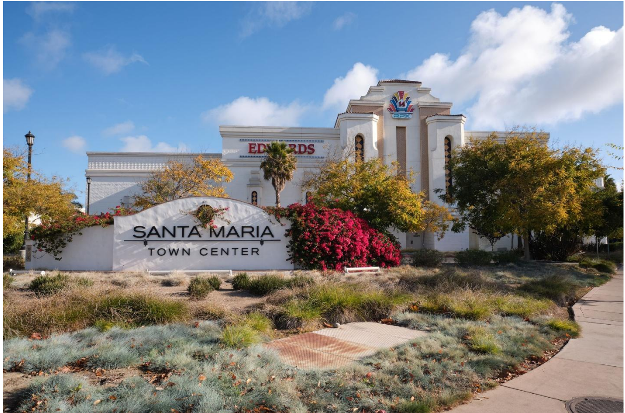
Santa Maria Town Center in Downtown Santa Maria.