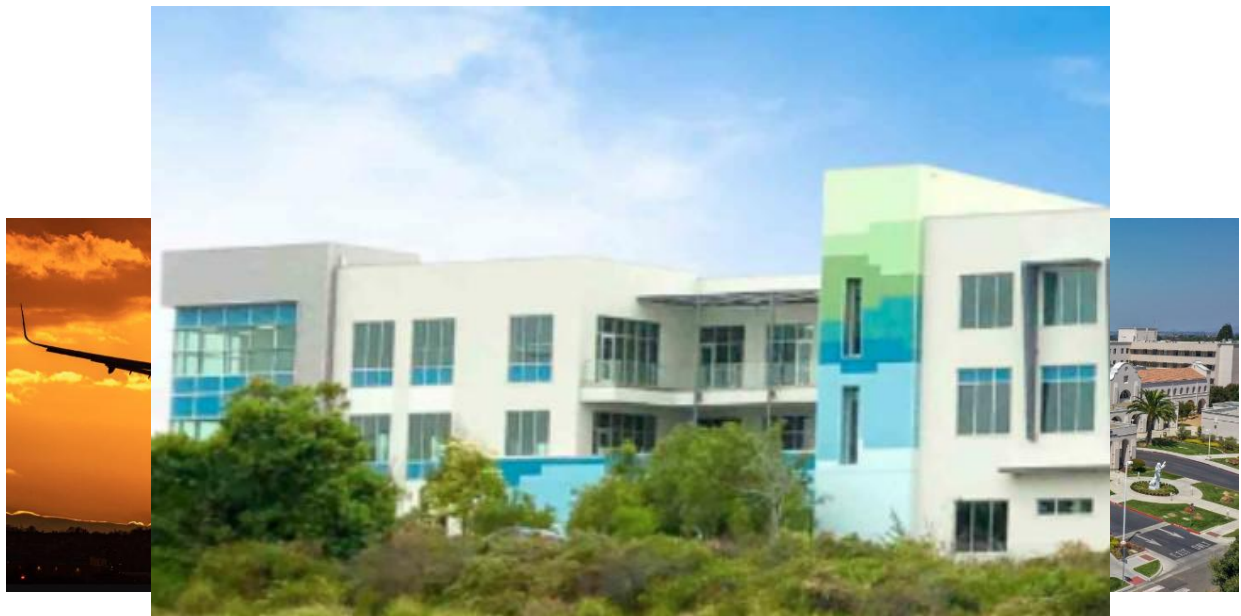
A.T. Still University Santa Maria Campus.

Workforce development and educational alignment. Santa Maria has a strong foundation in education and workforce services, supported by institutions such as Allan Hancock College and Santa Maria Joint Union High School District's the Mark Richardson Career Technical Education Center , as well as and A.T. Still University and programs like Build Your Workforce and the America's Job Center of California. Santa Maria Joint Union High School District and Allan Hancock College also offer college and career readiness programs for students, such as the College Readiness and Career Technical Education (CTE) Pathway, to strengthen the connection between education and workforce development. While the City has expanded opportunities for higher-paying jobs in manufacturing, the medical field, and agriculture However , the limited availability of higher-wage jobs and more advanced training remains a challenge. Strengthening local partnerships can help Santa Maria grow a more skilled, locally employed workforce.