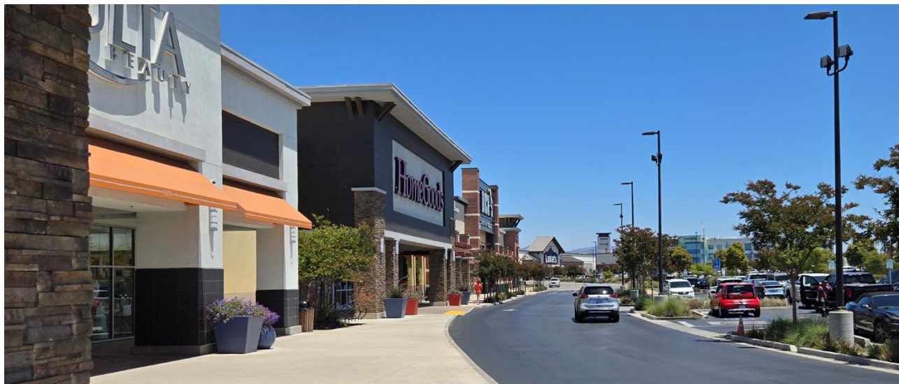
Enos Ranchos Shopping Center on Betteravia Road.

The Economic Development Element provides a framework for fostering a diverse and resilient economy in Santa Maria. It supports high-quality jobs, educational and workforce development opportunities, and a business-friendly environment that encourages innovation and investment. The Element emphasizes the revitalization of commercial corridors and the Downtown area, support for key industries, and the enhancement of infrastructure and housing diversity to meet the needs of a growing community. Through regional collaboration, targeted industry support, and an expanded tourism sector, Santa Maria can bolster economic opportunities, strengthen its identity, and advance long-term prosperity for residents and businesses.