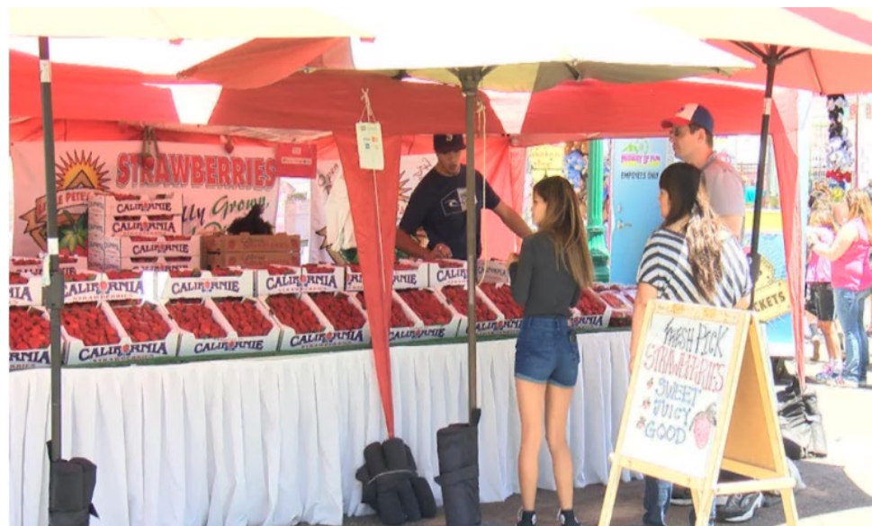
Santa Maria Strawberry Festival.