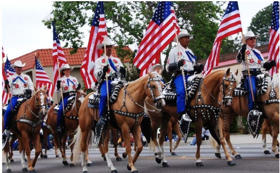
Santa Maria Elks Rodeo Parade.