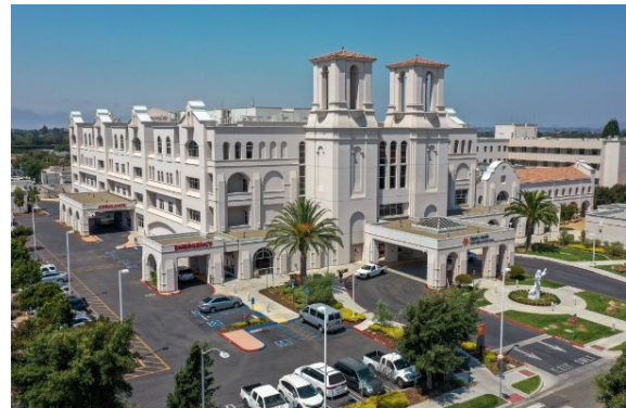
Marian Regional Medical Center.

Downtown and corridor revitalization. Renewed investment can help transform Santa Maria's commercial corridors and Downtown area into vibrant economic hubs. Revitalizing these areas through mixed-use development, infill housing, and coworking-office space supports local businesses and creates lively destinations for residents and visitors.