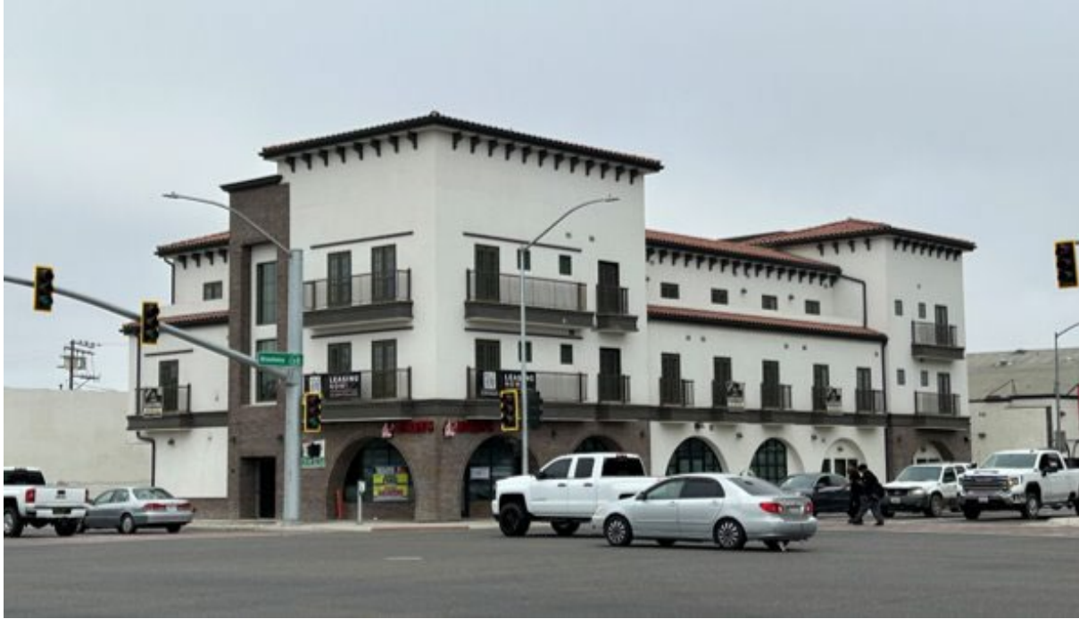
Gateway Mixed-Use Project located on the northwest corner of Main Street and Broadway. This building was constructed in 2024 and is an example of recent revitalization efforts in the Downtown area.

Regional collaboration. The City participates in several collaborative economic efforts that offer important opportunities to support business development, workforce alignment, and regional competitiveness. Continued coordination with Vandenberg Space Force Base, the Santa Maria Airport District, and educational institutions can advance the growth of target sectors.