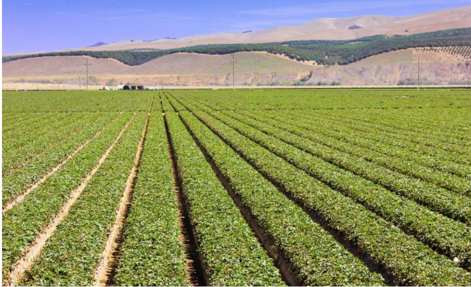
Agricultural fields in the Santa Maria Valley.