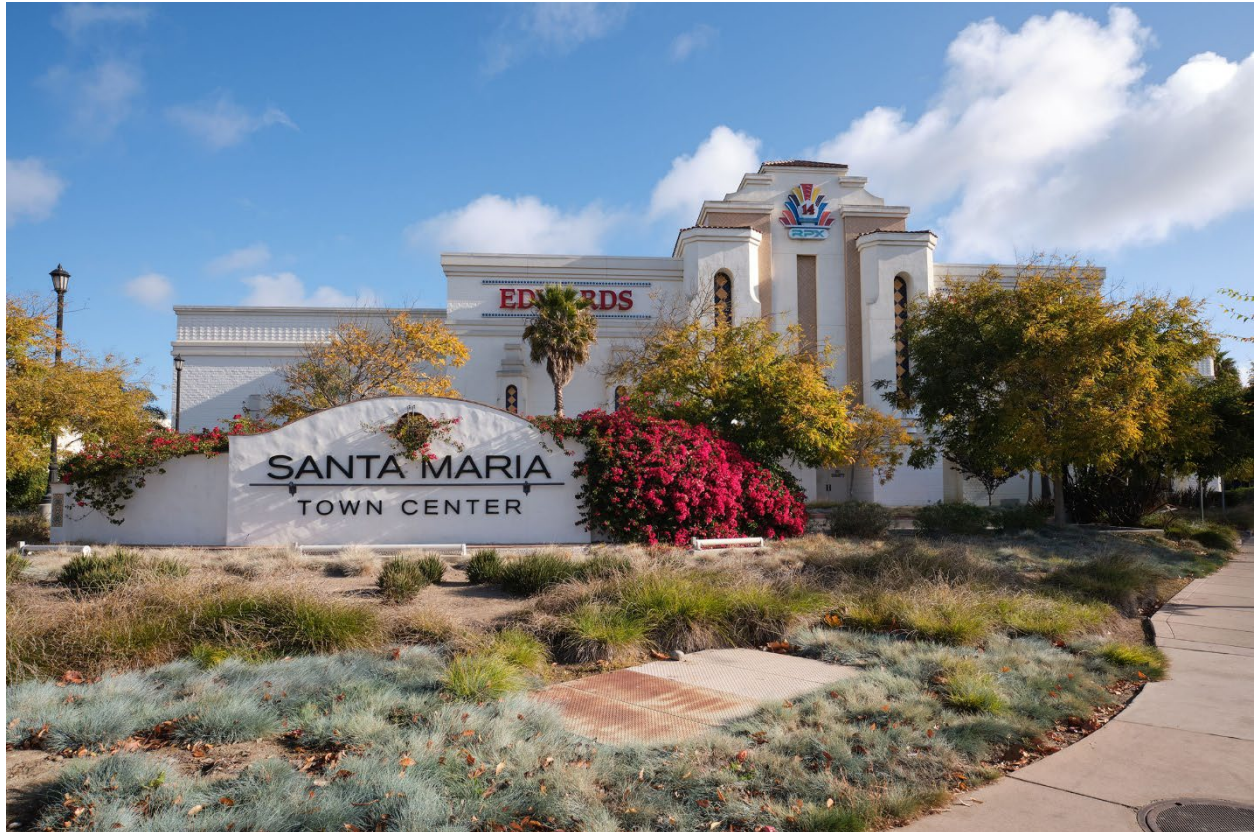
Santa Maria Town Center in Downtown Santa Maria.