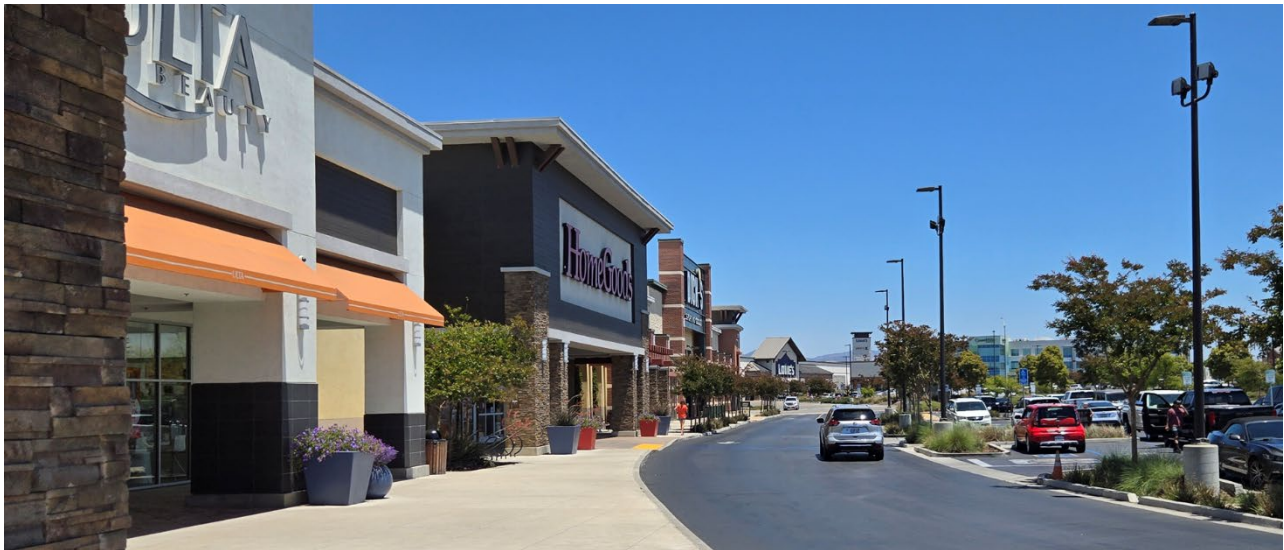
Enos Ranchos Shopping Center on Betteravia Road.

The Economic Development Element provides a framework for fostering a diverse and resilient economy in Santa Maria. It supports high-quality jobs, educational and workforce development opportunities, and a business-friendly environment that encourages innovation and investment. The Element emphasizes the revitalization of commercial corridors and the Downtown area, support for key industries, and the enhancement of infrastructure and housing diversity to meet the needs of a growing community. Through regional collaboration, targeted industry support, and an expanded tourism sector, Santa Maria can bolster economic opportunities, strengthen its identity, and advance long-term prosperity for residents and businesses.