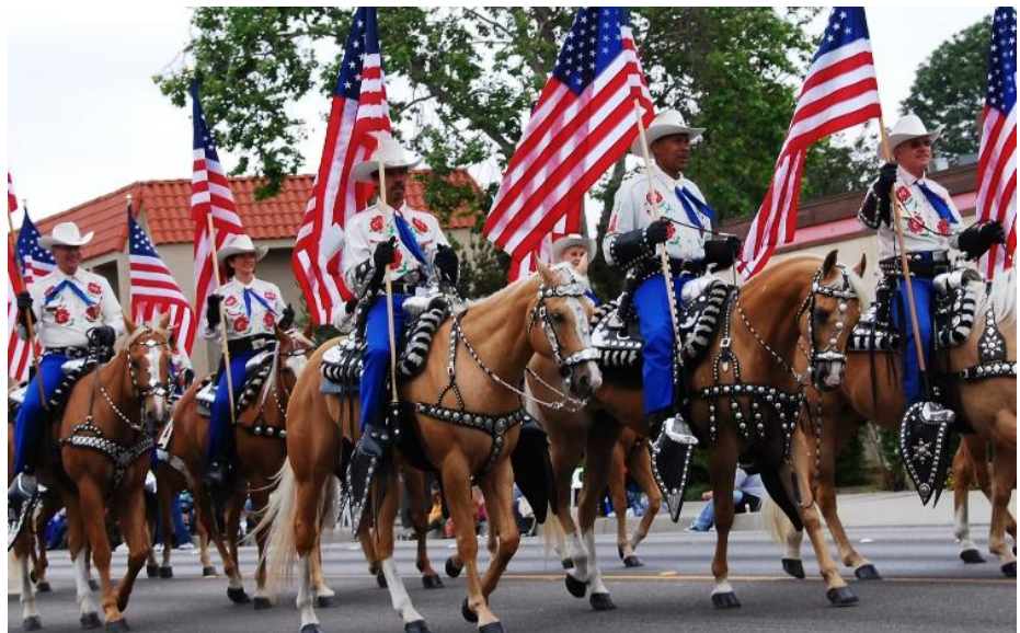
Santa Maria Elks Rodeo Parade.