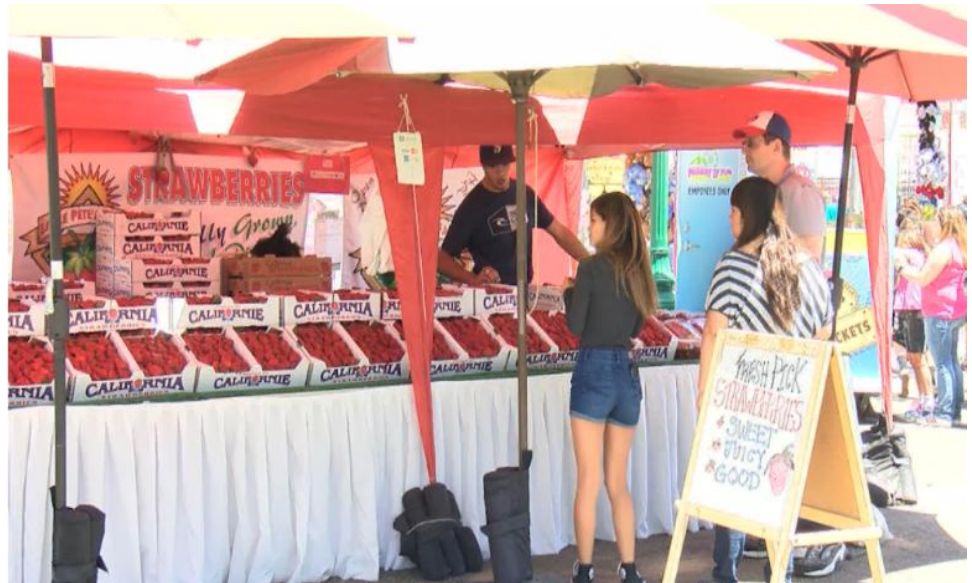
Santa Maria Strawberry Festival.

Agricultural fields in the Santa Maria Valley.