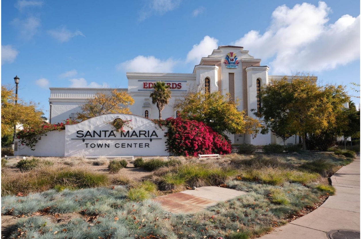
Santa Maria Town Center in Downtown Santa Maria.