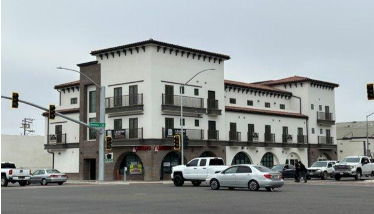
Gateway Mixed-Use Project located on the northwest corner of Main Street and Broadway. This building was constructed in 2024 and is an example of recent revitalization efforts in the Downtown area.

Regional collaboration. The City participates in several collaborative economic efforts that offer important opportunities to support business development, workforce alignment, and regional competitiveness. Continued coordination with Vandenberg Space Force Base, the Santa Maria Airport District, and educational institutions can advance the growth of target sectors.