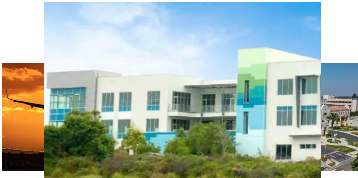
A.T. Still University Santa Maria Campus.

Workforce development and educational alignment. Santa Maria has a strong foundation in education and workforce services, supported by institutions such as Allan Hancock College and Santa Maria Joint Union High School District's the Mark Richardson Career Technical Education Center , as well as and A.T. Still University and programs like Build Your Workforce and the America's Job Center of California. Santa Maria Joint Union High School District and Allan Hancock College also offer college and career readiness programs for students, such as the College Readiness and Career Technical Education (CTE) Pathway, to strengthen the connection between education and workforce development. While the City has expanded opportunities for higher-paying jobs in manufacturing, the medical field, and agriculture However, the limited availability of higher-wage jobs and more advanced training remains a challenge. Strengthening local partnerships can help Santa Maria grow a more skilled, locally employed workforce.