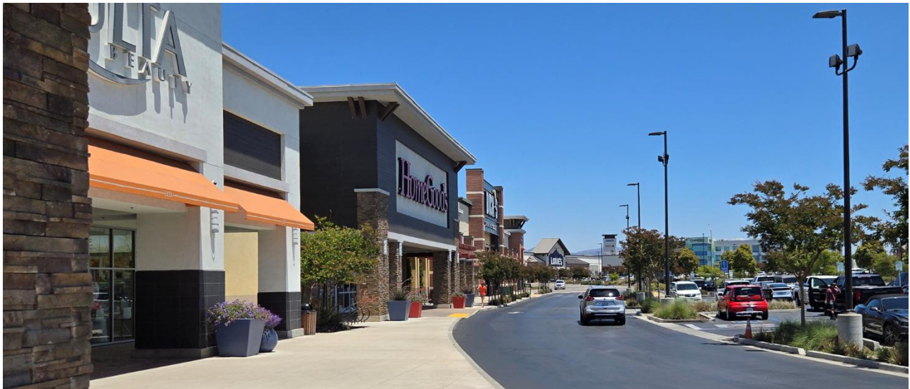
Enos Ranchos Shopping Center on Betteravia Road.

The Economic Development Element provides a framework for fostering a diverse and resilient economy in Santa Maria. It supports high-quality jobs, educational and workforce development opportunities, and a business-friendly environment that encourages innovation and investment. The Element emphasizes the revitalization of commercial corridors and the Downtown area, support for key industries, and the enhancement of infrastructure and housing diversity to meet the needs of a growing community. Through regional collaboration, targeted industry support, and an expanded tourism sector, Santa Maria can bolster economic opportunities, strengthen its identity, and advance long-term prosperity for residents and businesses.