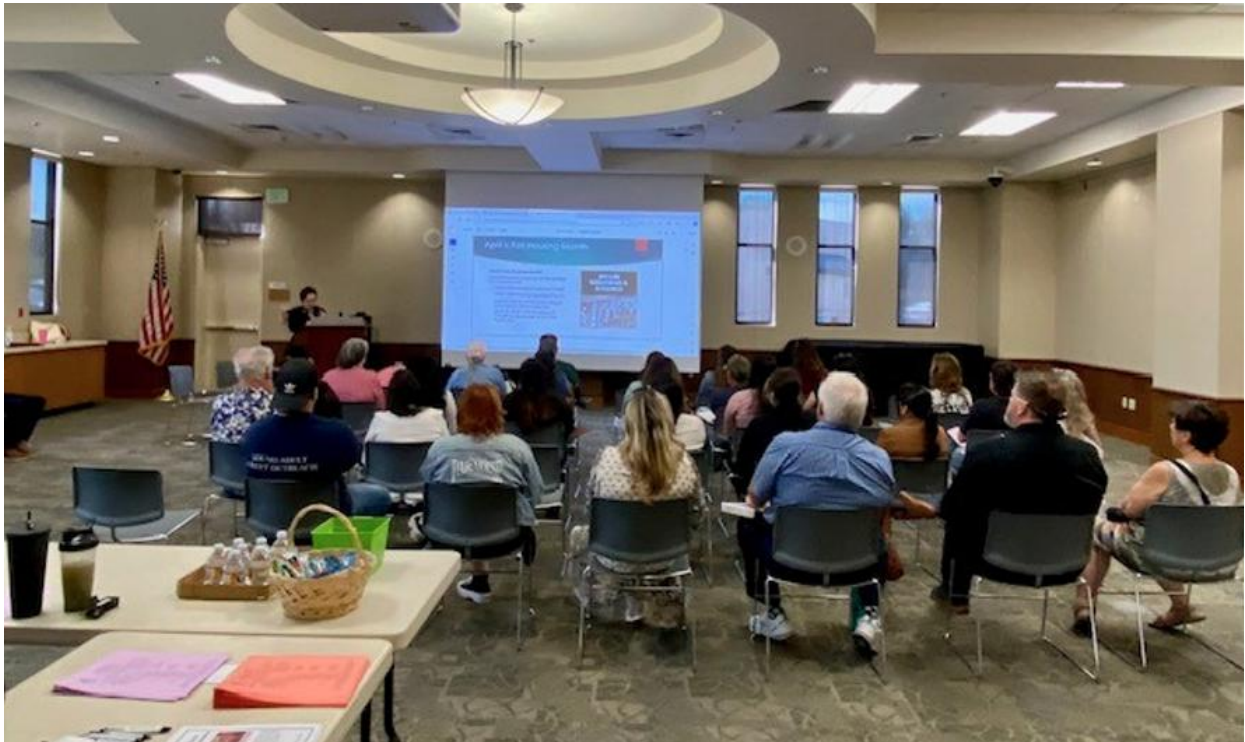
Public meeting held in Shepard Hall in the Santa Maria Library.