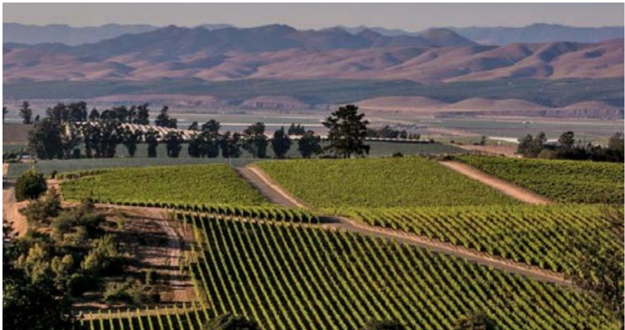
Agricultural fields in Santa Maria.

Relative to other communities in California, Santa Maria experiences has higher rates of pesticide exposure, as the majority of census tracts in the city are above the 80th percentile for pesticide use. Pesticide use during agricultural production poses significant public health risks since both short-term and long-term exposure are linked to serious illnesses such as cancers, pregnancy complications, and developmental issues—especially for children, pregnant women, older adults, and agricultural workers. DACs that are located near agricultural fields, including farmworker communities in and around Santa Maria, face heightened exposure risks.