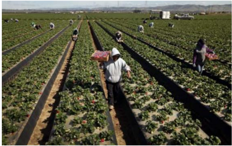
Workers employed in agriculture in Santa Maria.

The increasing number of H-2A Visa workers in agricultural jobs and the associated requirements for employers to supply worker housing have heightened the need for increasing the amount of safe and affordable housing in the city. Accessory Dwelling Units and new housing developments (particularly multi-family housing) will continue to assist in providing additional housing opportunities in the city.