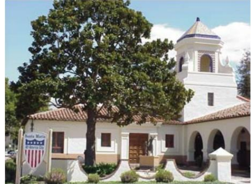
Santa Maria City Hall