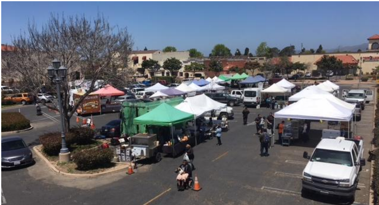
Farmers' Market in Santa Maria's Downtown

The rate of food insecurity among adults in Santa Maria (16 percent% ) is twice the rate for Santa Barbara County (8 percent% ). Food insecurity can lead to undernutrition, fatigue, stunted development, and related health issues. Access to food is most limited in the city's northeast and northwest areas, in addition to a large area southwest of Downtown. In some of these areas, 33 percent% of the population lives more than one mile from a supermarket, supercenter, or large grocery store. During engagement activities, community members identified the need for more equitable access to nutritious food (e.g., gardens, corner stores selling healthier food), a greater variety of healthy food choices, and more affordable food.