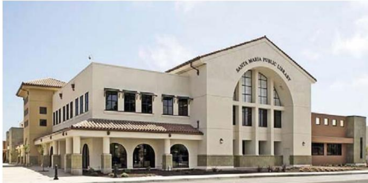
Santa Maria Public Library

Throughout the engagement process, many community members shared that they faced barriers that limit their ability to participate in City activities and decision-making, such as a lack of awareness, inconvenient meeting times, and language access. These barriers often impact low-income residents, youth, people with disabilities, and those with limited English proficiency. Specifically, youth members shared an interest in participating in the civic process but some lacked the knowledge or awareness of how and when they could participate.