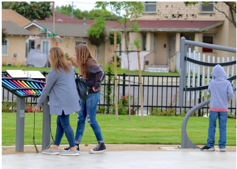
Top and bottom: Access to parks and other greenspaces, like Machado Plaza in Santa Maria's Downtown on Chapel Street, is essential to community health.