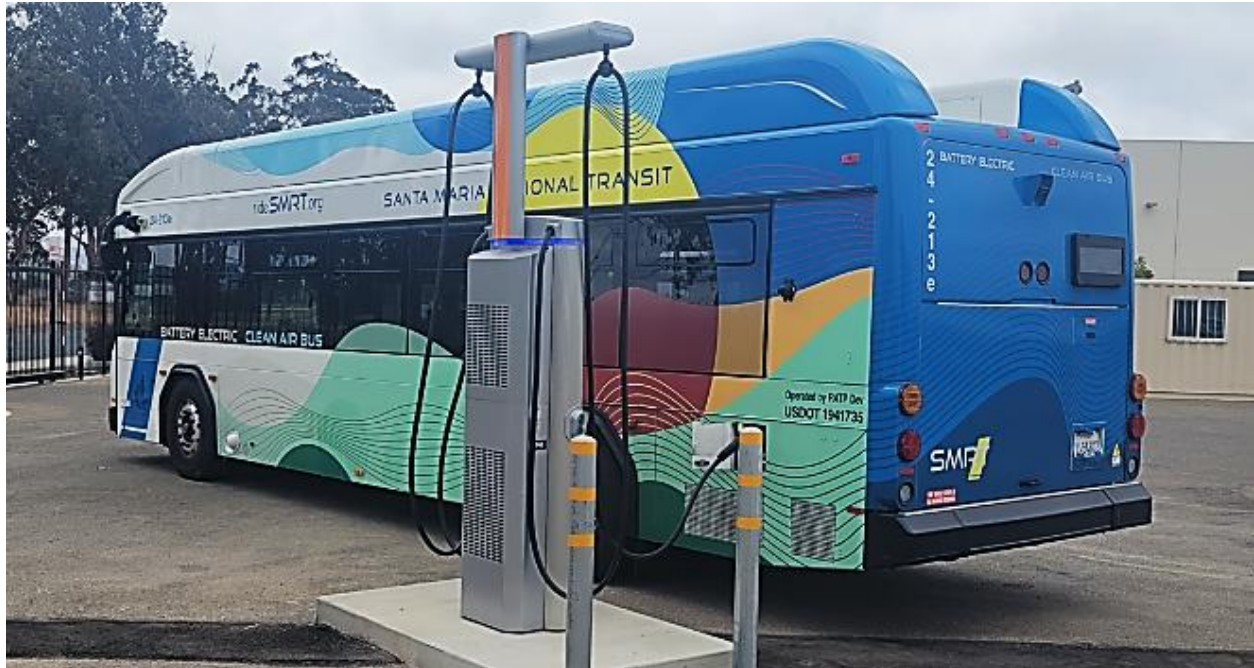
SMRT Electric Bus