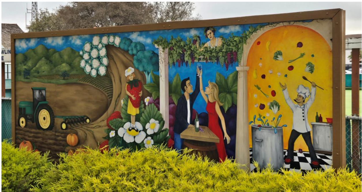
Painted mural located on South McClelland Street in Santa Maria.

The goals, policies, and implementation actions provide a roadmap for elevating the quality of life in Santa Maria by reducing pollution; promoting safe and affordable housing; enhancing opportunities to lead healthy lives through access to healthy food, active transportation, public facilities, and healthcare facilities; and fostering greater civic engagement opportunities.