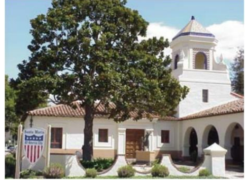
Santa Maria City Hall