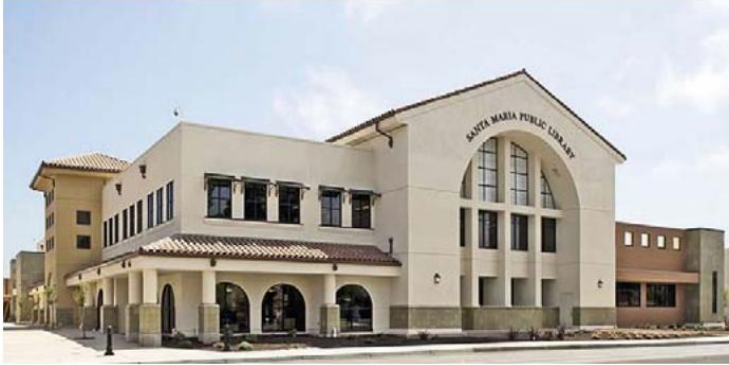
Santa Maria Public Library

Throughout the engagement process, many community members shared that they faced barriers that limit their ability to participate in City activities and decision-making, such as a lack of awareness, inconvenient meeting times, and language access. These barriers often impact low-income residents, youth, people with disabilities, and those with limited English proficiency. Specifically, youth members shared an interest in participating in the civic process but some lacked the knowledge or awareness of how and when they could participate.