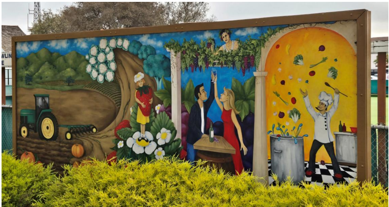
Painted mural located on South McClelland Street in Santa Maria.

The goals, policies, and implementation actions provide a roadmap for elevating the quality of life in Santa Maria by reducing pollution; promoting safe and affordable housing; enhancing opportunities to lead healthy lives through access to healthy food, active transportation, public facilities, and healthcare facilities; and fostering greater civic engagement opportunities.