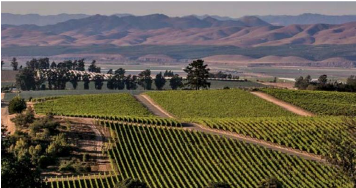
Agricultural fields in Santa Maria.

Relative to other communities in California, Santa Maria experiences has higher rates of pesticide exposure, as the majority of census tracts in the city are above the 80th percentile for pesticide use. Pesticide use during agricultural production poses significant public health risks since both short-term and long-term exposure are linked to serious illnesses such as cancers, pregnancy complications, and developmental issues—especially for children, pregnant women, older adults, and agricultural workers. DACs that are located near agricultural fields, including farmworker communities in and around Santa Maria, face heightened exposure risks.