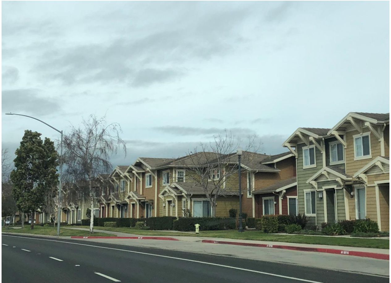
Housing abutting main corridors is often impacted by transportation noise.