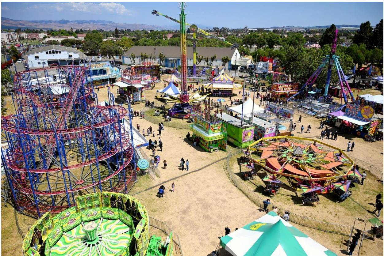
Santa Barbara County Fair at the Santa Maria Fairpark.

Additionally, noise from operations at the nearby Vandenberg Space Force Base continues to impact many communities on the Central Coast, including Santa Maria. Launch noise and subsequent sonic booms can be heard throughout the city and central coast region, as far south as the City of Santa Barbara.