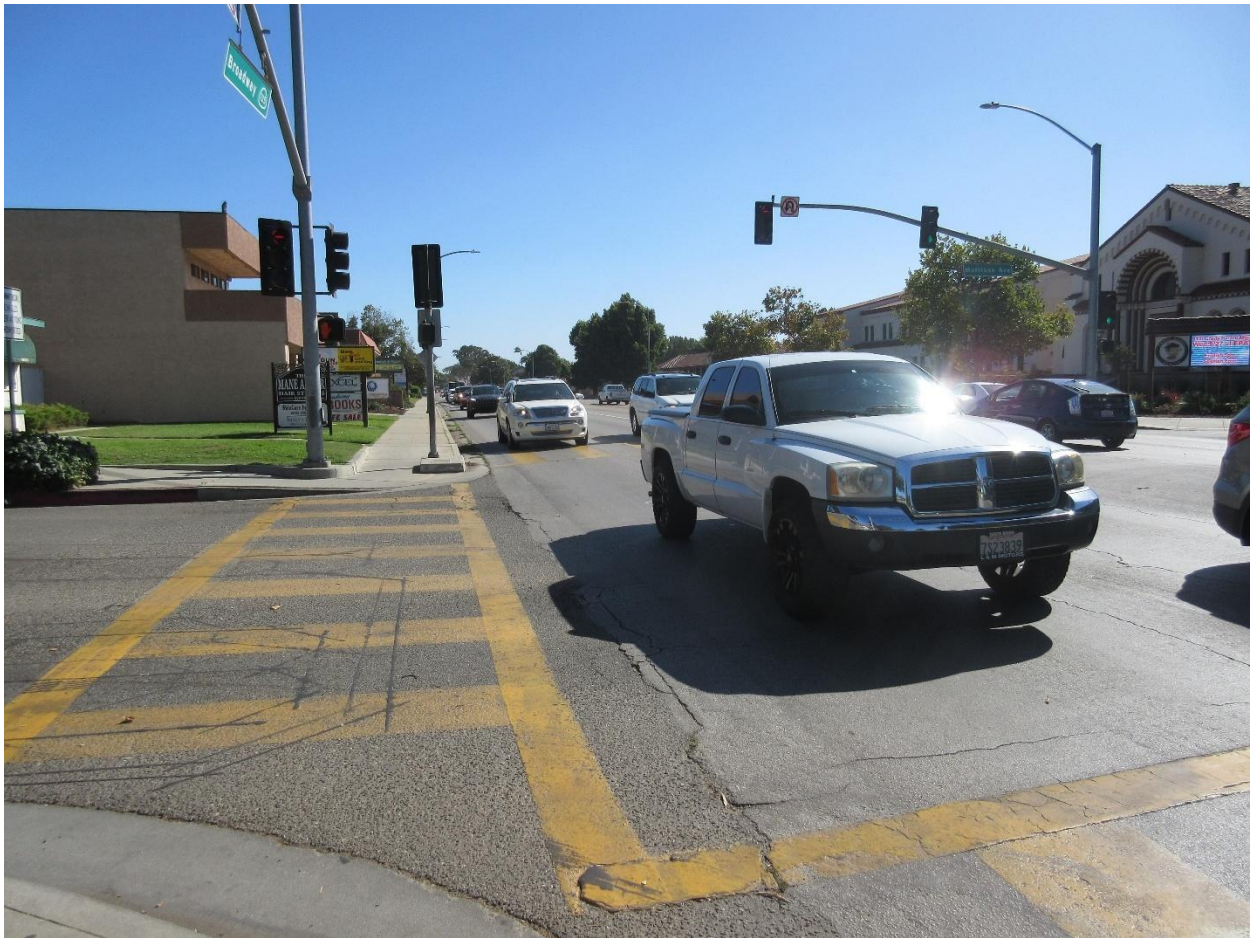
Automobile traffic on Broadway is a source of noise in the city.