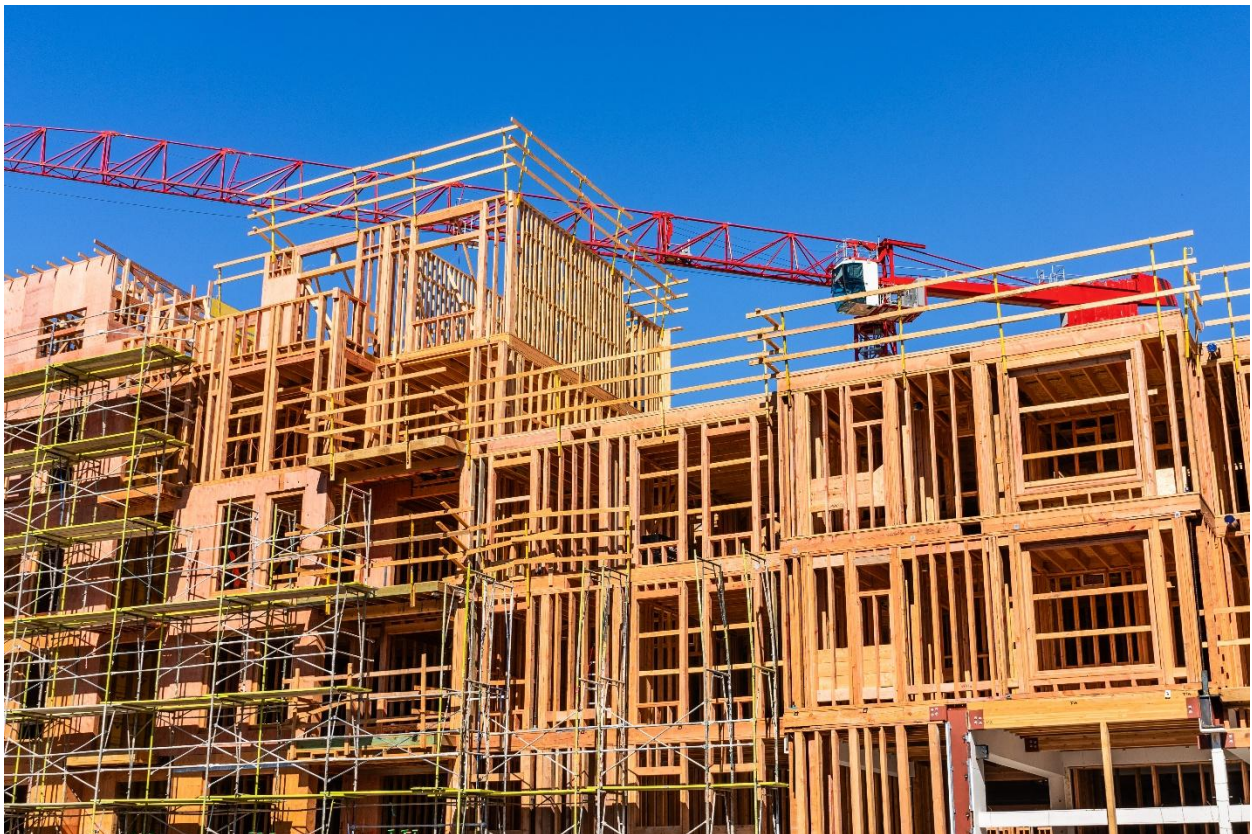
Noise generated from the construction of a housing development.

Construction activity can generate substantial short-term increases in noise levels within the vicinity. Each phase of demolition and construction has its own noise characteristics; some may generate substantial intermittent noise levels from high-impact activities like pile-driving, while others may generate high continuous noise levels, depending on the type and amount of equipment used. Noise levels from individual pieces of construction equipment range from 76 to 101 dBA Leq (Equivalent Energy Level) at 50 feet, and nearby noise-sensitive receivers may find this disruptive.